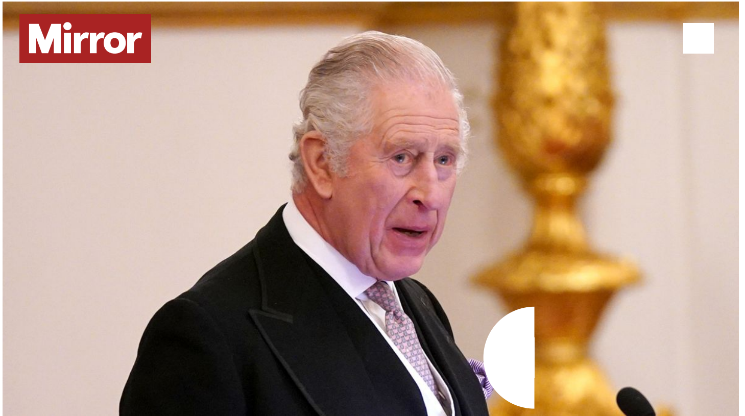
The King was due to attend the event next Monday