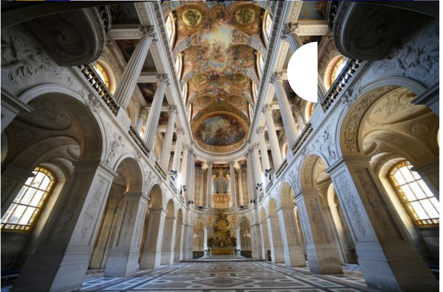
The stunning Palace of Versailles was set to welcome the King next week

As well as riots, anti-Emmanuel Macron protests in France have also included some 10,000 tonnes of rubbish building up on the streets of Paris after binmen withdrew their labour.