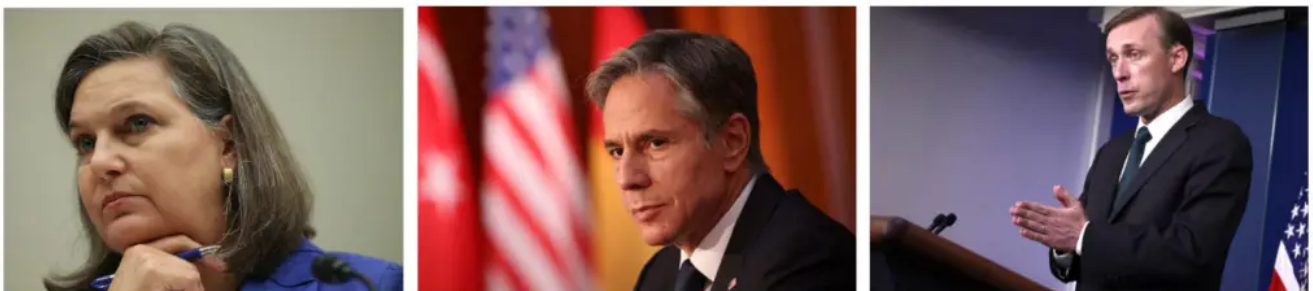
THE PLAYERS Left to right: Victoria Nuland, Anthony Blinken, and Jake Sullivan.

What became clear to participants, according to the source with direct knowledge of the process, is that Sullivan intended for the group to come up with a plan for the destruction of the two Nord Stream pipelines—and that he was delivering on the desires of the President.